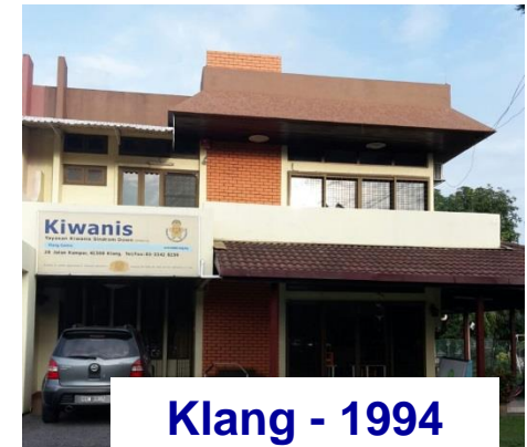
Klang - 1994