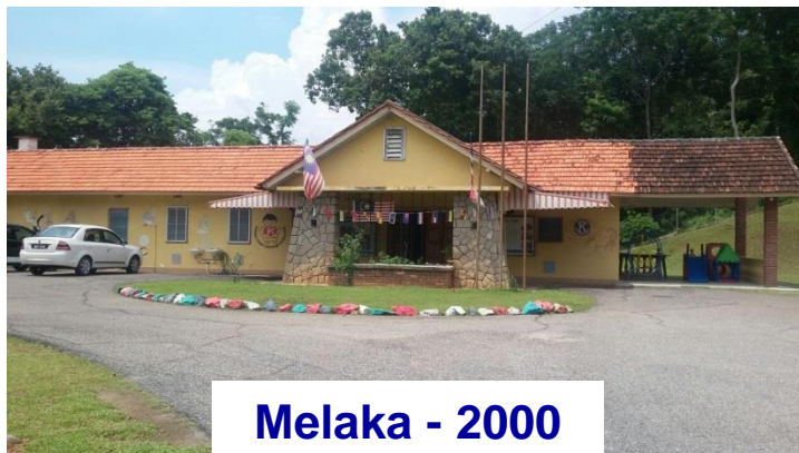
Melaka - 2000