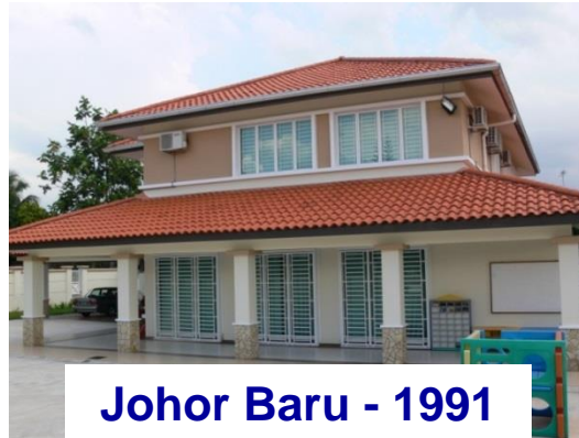
Johor Baru - 1991