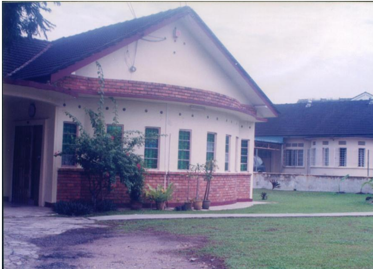
1989 KDSF – Petaling Jaya