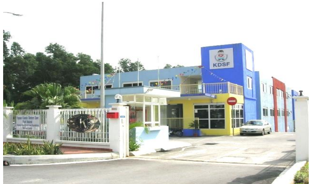
2004 KDSF – National Centre