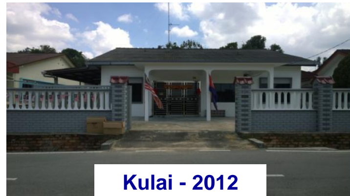
Kulai - 2012