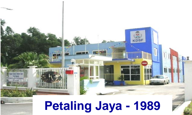
Petaling Jaya - 1989